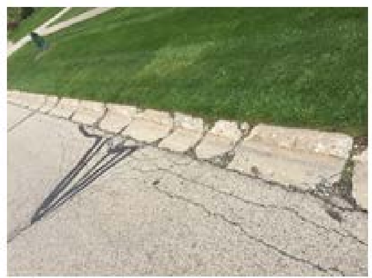
Curb and Sidewalk Replacement