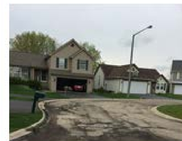
Road Resurfacing Program