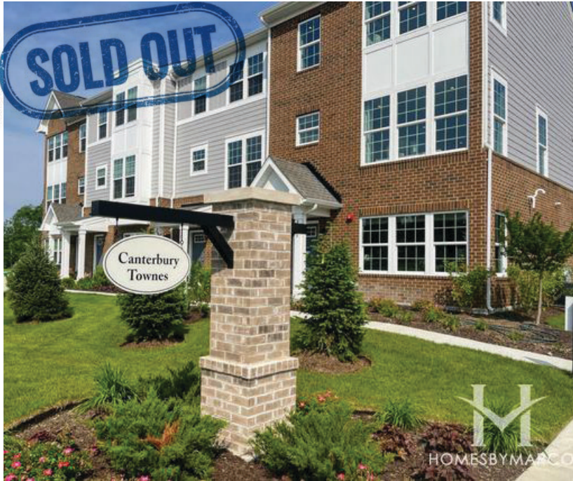
Canterbury Townes, Route 22

Economic Development. Lake Zurich is the primary economic hub for southwest Lake County with a booming Rand Road corridor and thriving industrial park. The Village seeks to expand the economic base of the community with a focus on the Main Street District in order to further establish and expand Lake Zurich as a regional economic hub.