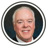
MAYOR TOM POYNTON